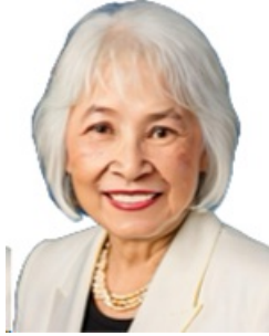
Paul Harris Society Chair, PDG

We are thrilled to extend our warmest congratulations to the Rotary Club of Lemoore for achieving an extraordinary milestone: 100% Paul Harris Society membership. This remarkable accomplishment reflects the unwavering commitment and generosity of each member towards Rotary's mission of making a lasting impact on communities worldwide.